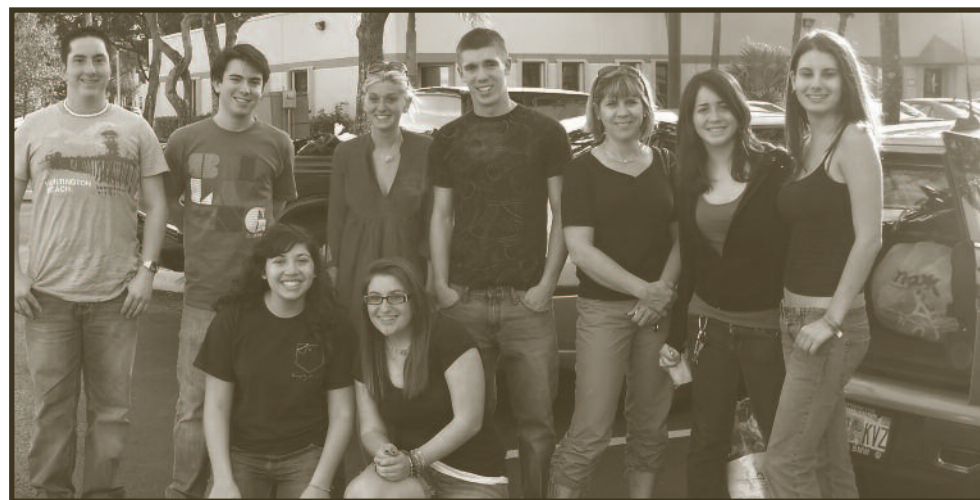
Western High School Psychology Club members

support by collecting used items that were published on Henderson's website "Wish List." The members delivered several car-loads of clothing, toys, and other items to help fill in the needs of our clients who live on modest incomes.